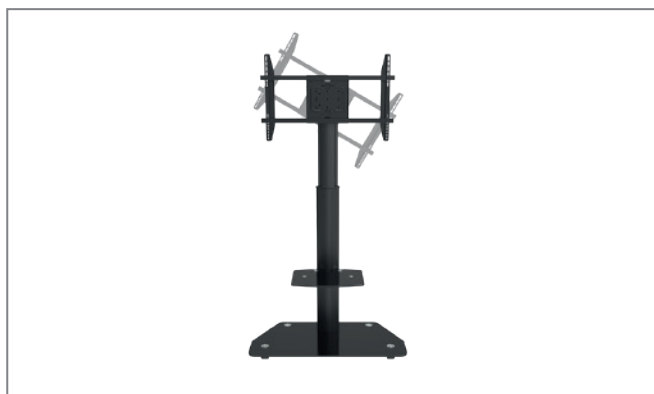
usable with HP Stand 55 (Item no.: 9425)