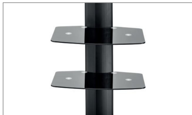
several glass shelves can be mounted one above the other